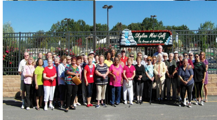
View past events at: www.evergreenseniors.weebly.com

Evergreen Senior Center is committed to serving the residents of Woodbridge Township who are 60 years and older.